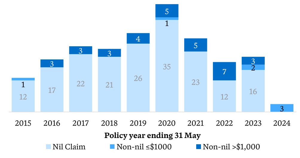
Figure 1 – Reported claims by policy year as at 4 July 2023

Figure 1 shows from 2015 to 2018, there were between one and three non-nil claims per policy year (or 8% to 17% of all reported claims are non-nil claims). The 2019 to 2023 policy years show higher non-nil claims, ranging between four and seven non-nil claims per policy year. This is in part due to claims with an incurred cost less than or equal to $1,000 which have yet to be finalised, with all but 1 of the non-nil claims with an incurred cost of less than or equal to $1,000 comprising solely of case estimates. Historical experience has indicated that these claims typically settle for nil in subsequent years.