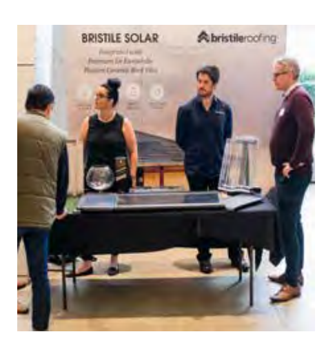
[Image 2] Partners Living Fires at 2019 ArchiTeam Conference - Making A Living